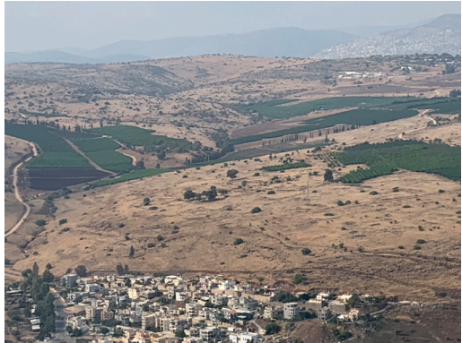
View of Galilee from Mt. Precipice