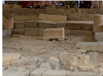
Table at Mandla