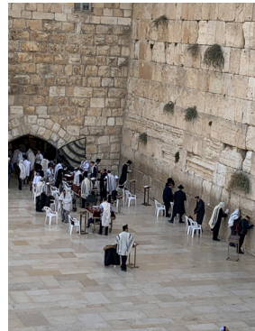
The Western Wall