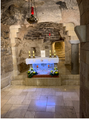
The Annunciation to Mary