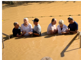
Baptism in the Jordan River