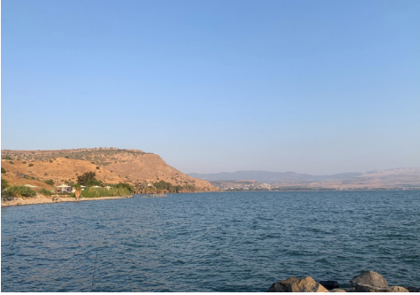
Arbel from Tiberius