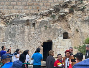
The Garden Tomb