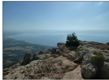
Two views of Galilee