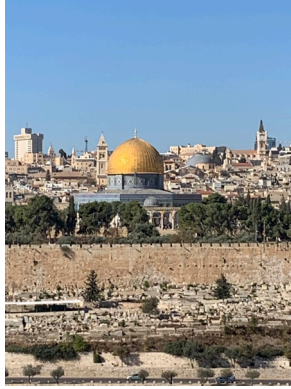
The Dome of the Rock