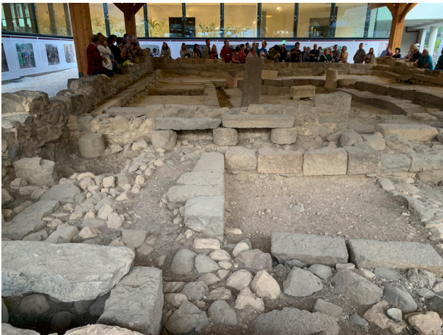
Synagogue at Mandla