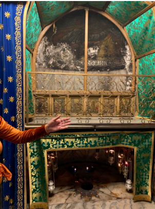
Traditional Site of the Lord's Birth