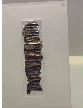
The oldest Hebrew Scroll with Levitical Blessing