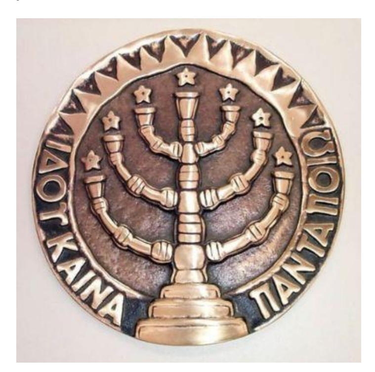
The Greek words around the seal reflect this year's theme, "Behold I make all things new."

— A way forward focused on the Lord and a life of useful service.