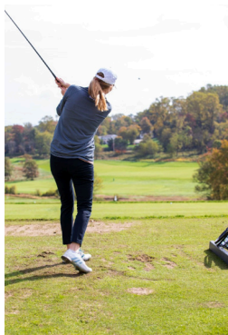
Swinging away on the driving range