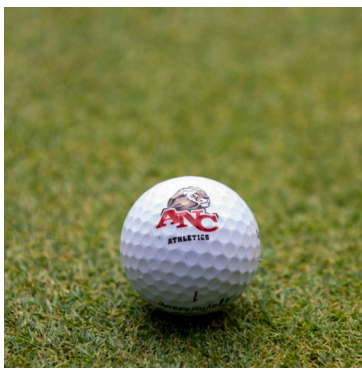
The official ANC golf ball