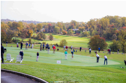
Warming up on the putting green