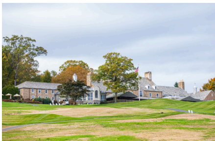
Heading back to the clubhouse