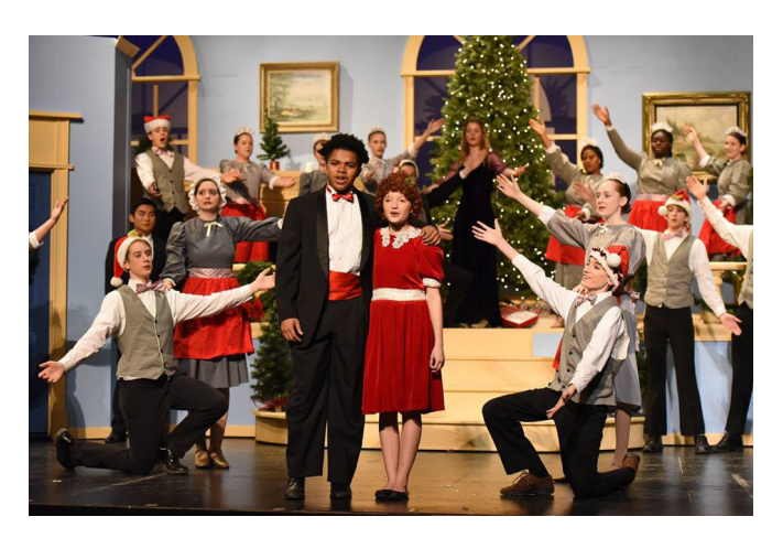
Daddy Warbucks and Annie celebrate her adoption at Christmas