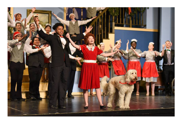
Daddy Warbucks, Annie, Sandy and company take a curtain call