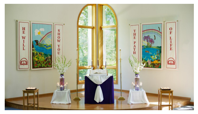
The chancel of the Glenview (Illinois) New Church