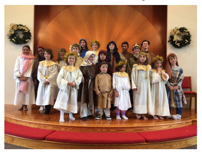
The Children's Christmas Pageant in Ivyland, Pennsylvania