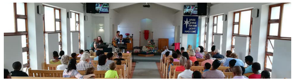
The New Church Buccleuch, Johannesburg, South Africa