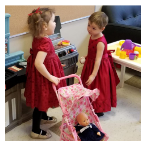
Social time after church in the Olivet Church, Toronto, Canada