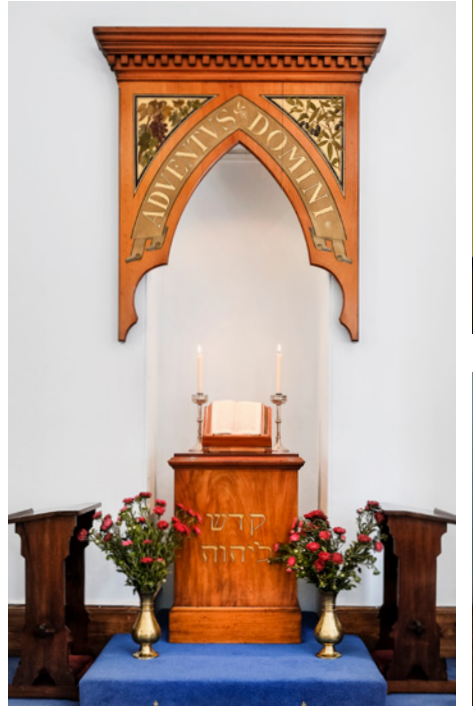
Michael Church Altar