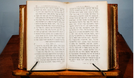
Open Word at the Michael Church