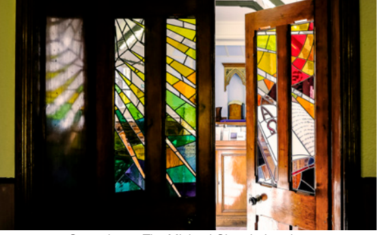
Open door - The Michael Church, London