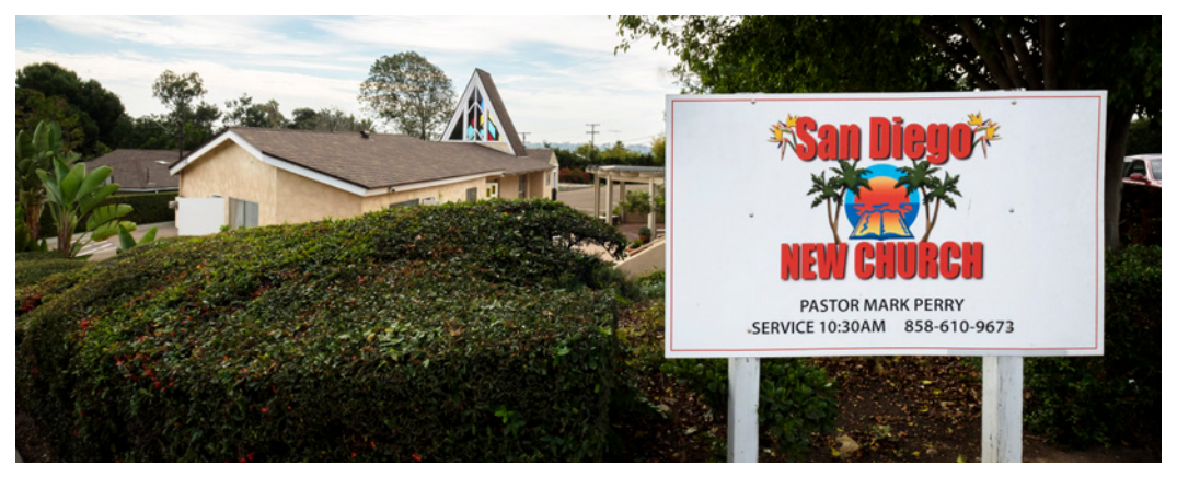
San Diego Church Buildings