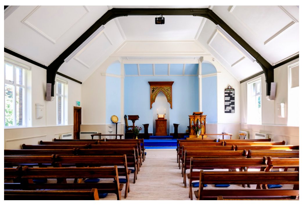
Michael Church Sanctuary