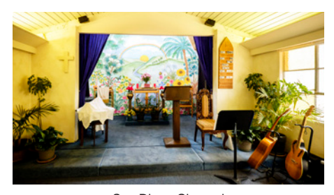
San Diego Chancel