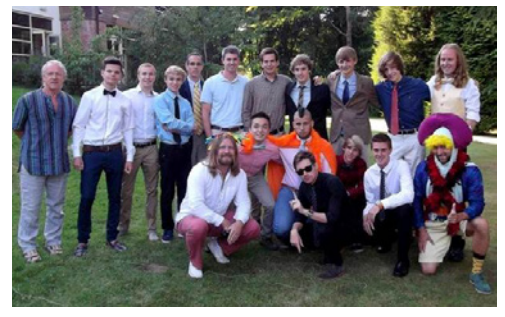
The 18 young men in attendance.