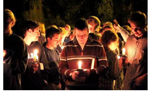
A quiet, candlelit moment.