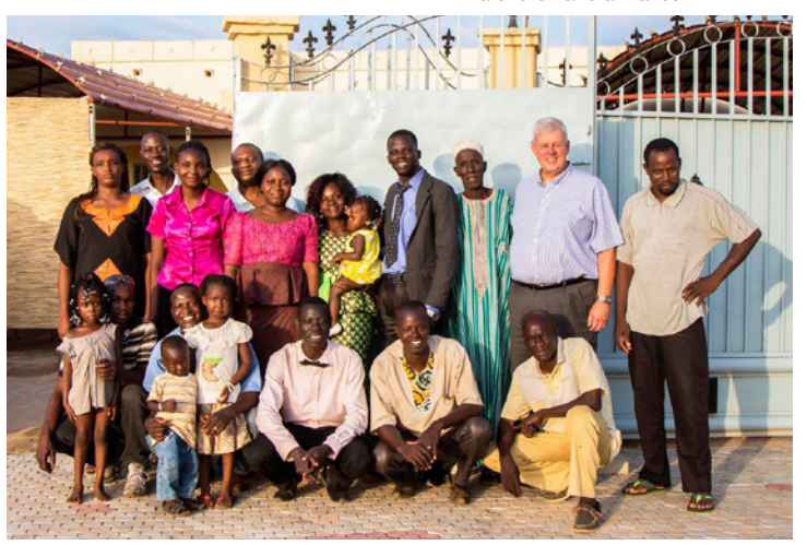
Thursday night doctrinal class group.