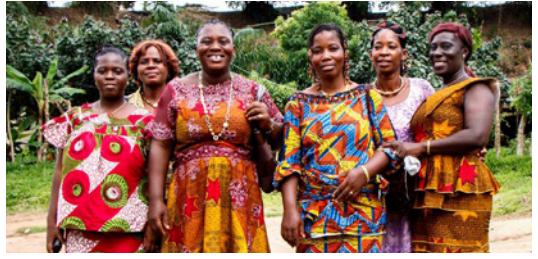
Six of the ministers' wives.