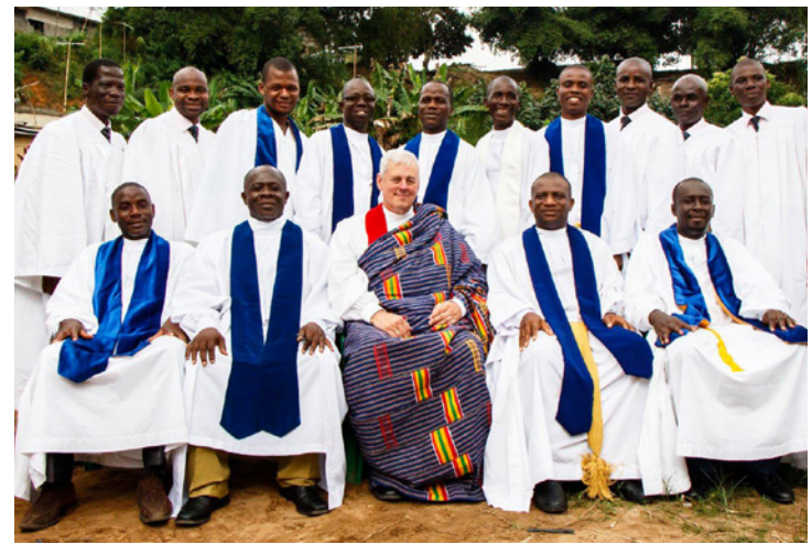
Bishop Keith in a ceremonial robe, surrounded by the ministers of the Ivory Coast.