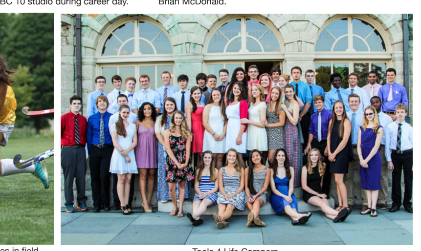
Tools 4 Life Campers.